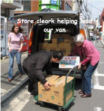
Store clerk helping load our van